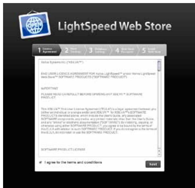
Step 1 of the web-based Web Store installer

In each scenario, you should now be able to access your Web Store's URL. Please see the Web Store 2.0 PDF document in the Training section of our website for instructions on how to configure and maintain your Web Store.